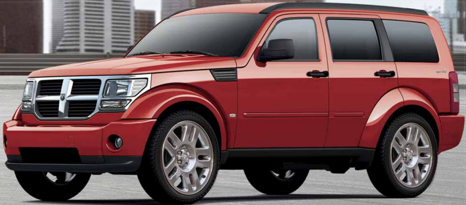
NITRO SXT IN INFERNO RED