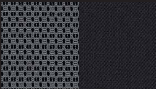
Everest II/Wallace II cloth Dark Slate Grey