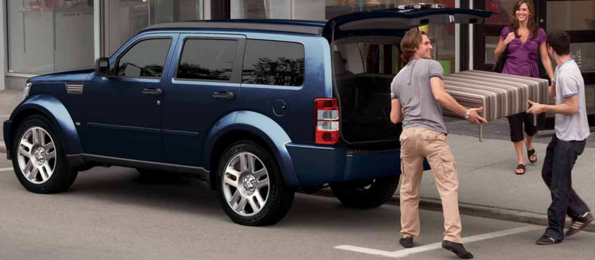
Nitro SXT shown in Deep Water Blue.