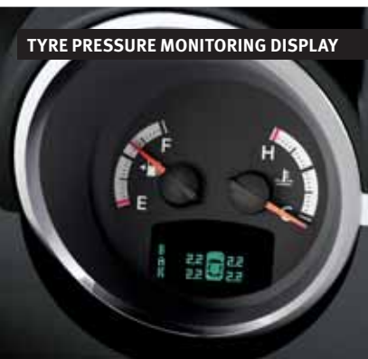
TYRE PRESSURE MONITORING DISPLAY