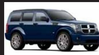
DEEP WATER BLUE