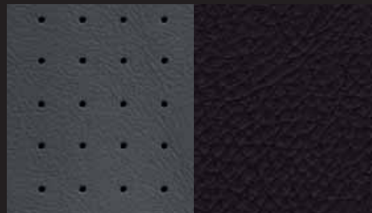
Royale Radar Leather Trim/ Sutton Vinyl Dark/Light Slate Grey