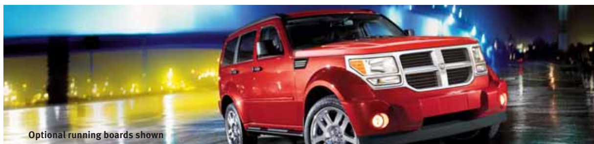
Optional running boards shown