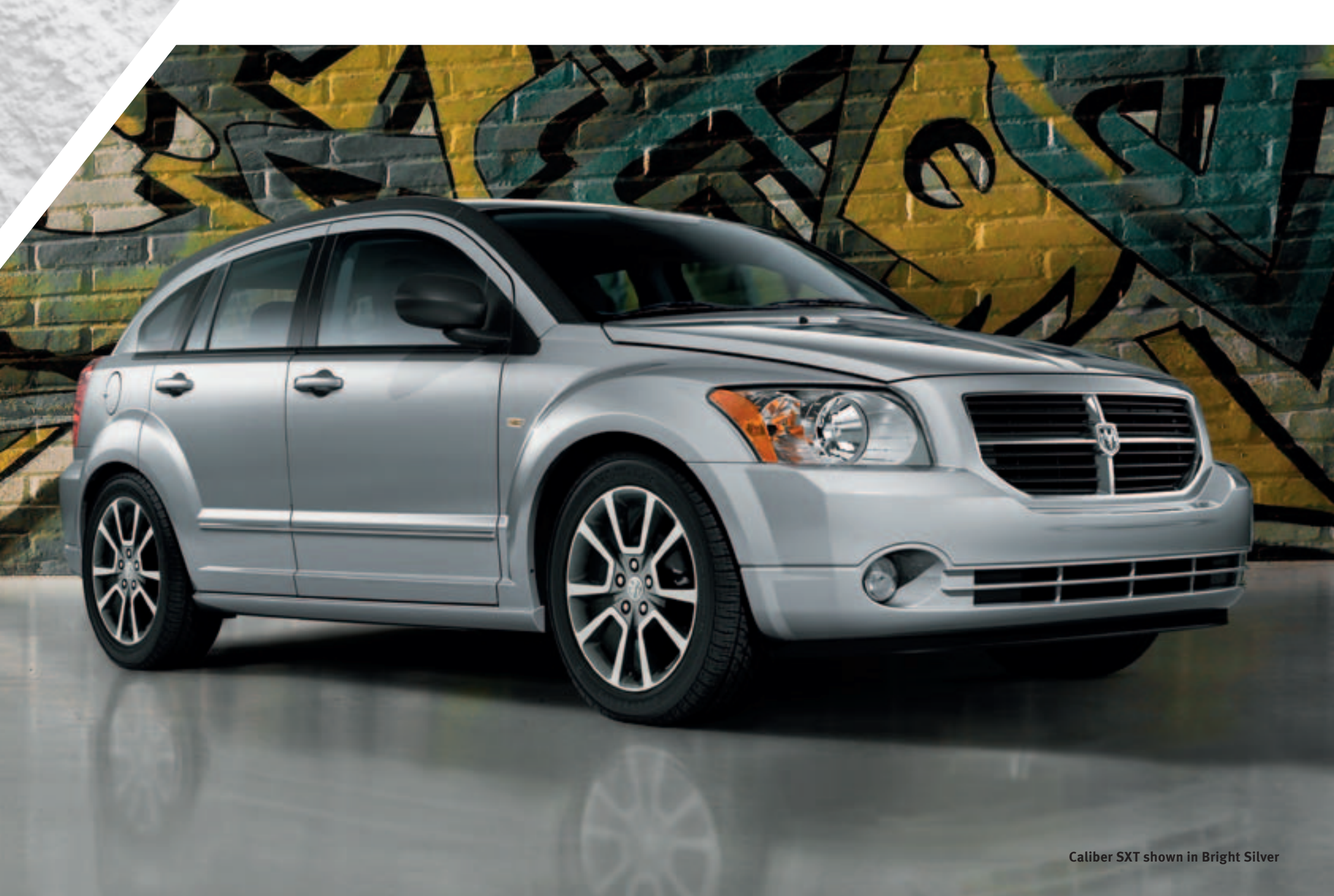
Caliber SXT shown in Bright Silver